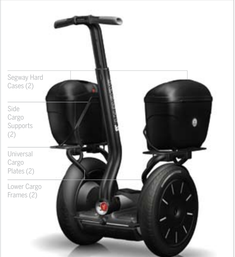
Segway Hard Cases (2)